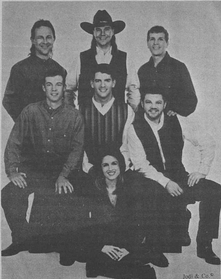
Jodi & Co. ©

The Quality Electronics/GTE Wireless stage will be full of energy on the opening night of the Colorado County Fair, Thursday, September 9th as The Emotions bring their Texas dancehall style show back for young and the old alike to enjoy. Country, rock, rap..... this band can do it all!